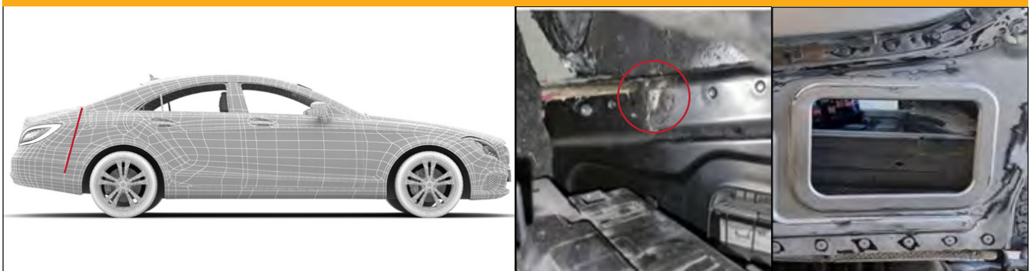
Image left: The rear portion only of the outer rear quarter panel has been partially sectioned rearward of the C pillar (cut and join location shown in RED ). Image middle: Interior inspection of the welded joint(s). Image right: Exterior inspection of rivet-bonded areas (with coatings and sealers removed).