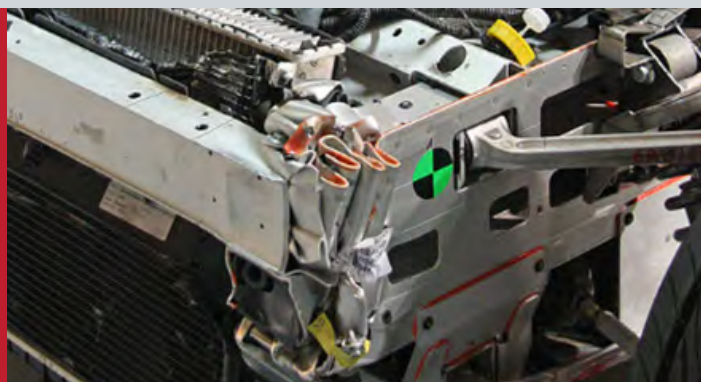
Image above: Typical (albeit dramatic), example of a crush zone performing its intended function during an impact.

WARNING: Frame rail crush zones absorb crash energy during a collision and must be replaced if damaged. Prior to replacement of frame rail crush zones, straighten damaged frame rails to correct frame dimensions. Failure to follow these instructions may adversely affect frame rail crush zone performance which could result in serious personal injury to vehicle occupants in a crash.