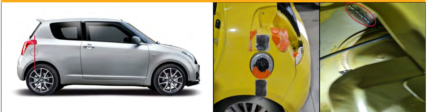
Image left: The rear portion only of the outer rear quarter has been partially sectioned through the middle of the fuel filler pocket (cut and join location shown in RED ). Image middle and right: Exterior and Interior inspection of the welded joint(s).